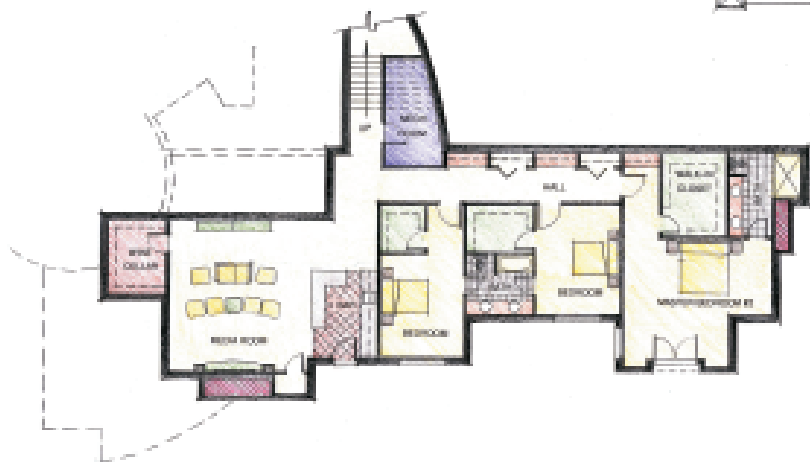
LOWER LEVEL FLOOR PLAN (2,534 SQ. FT.)