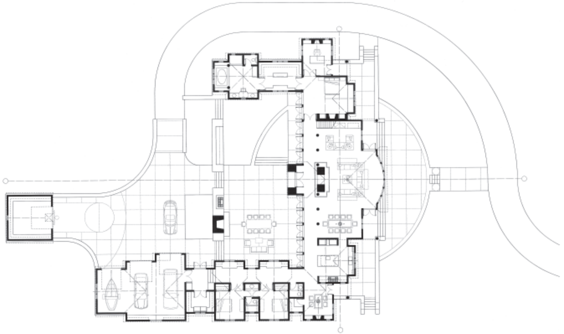
FLOOR PLAN (5,000 SQ. FT. - APPROX.)

ROZEWSKI & CO. DESIGNERS PHASE ONE, HOMESITE 7